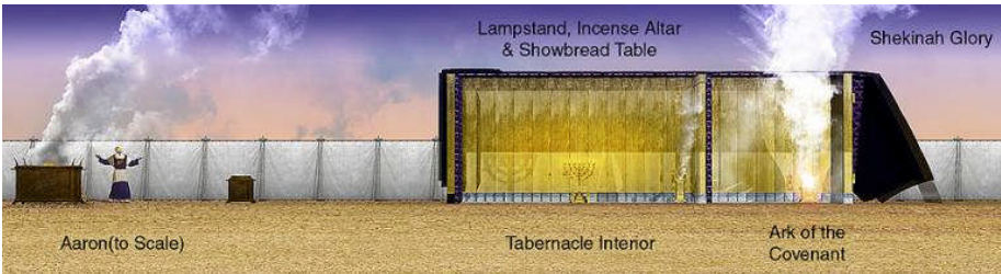
THE TABERNACLE IN THE DESERT

A veil separated man from the presence of God that was in the Holy of Holies Heb 9:3, only by the blood could you enter in. Heb 10:19 Therefore, brothers, having boldness to enter into the Holy of Holies by the blood of Jesus, Heb 10:20 by a new and living way which He has consecrated for us through the veil, that is to say, His flesh Mt 27:51 Mark 15:38 Luke 23:45 The veil of the temple was torn in two from top to bottom. Because of the sacrifice of Christ! Heb 7:27, 10:12