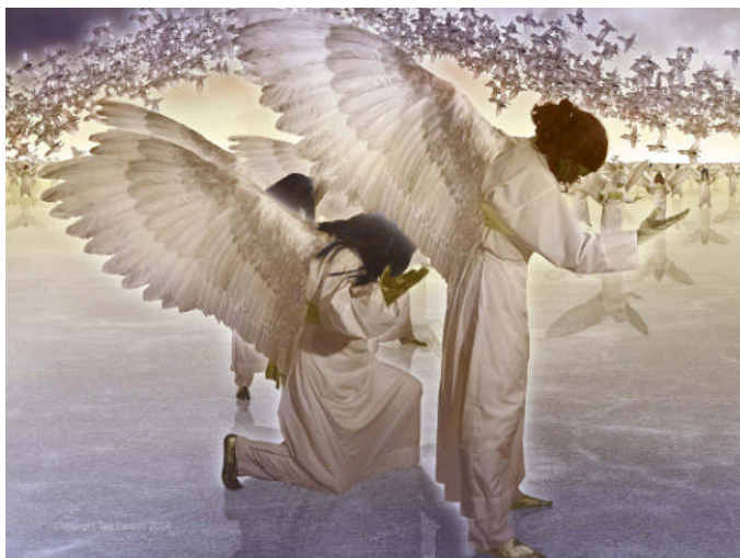
MILLIONS OF ANGELS WORSHIP CHRIST

Rev 4:10-11, 5:8, 13, 14, 7:11, 11:16, 19:4,