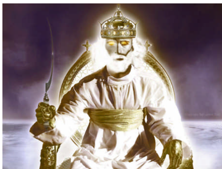
JESUS WITH THE SICKLE TO REAP THE EARTH (Rev 14:14-16)