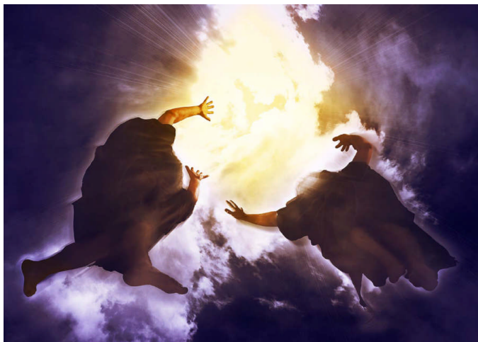
THE TWO WITNESSES ARE TAKEN TO HEAVEN

UNTIL THE 7 TH BOWL IS Poured (Rev 15:8)